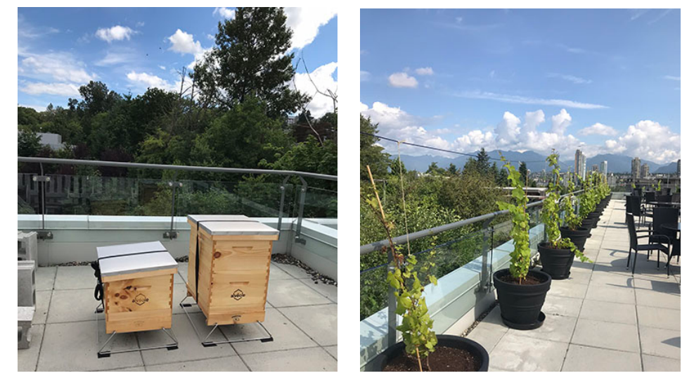
Honeybees and grapevines installed in communal outdoor areas at LDB's head office in Burnaby, BC.

In 2019, a new department was added to the LDB's Corporate Services Division. The department, named Corporate Social Impact, was created to lead the organization's corporate social impact strategy and to build awareness about LDB's social impact and environmental activities. The team consists of the Environmental Initiatives Manager and two newly developed positions, the Social Impact Manager and the Social Impact Specialist. The team supports all areas of the business and ensures alignment and consistency across all social impact initiatives. Initiatives led by this department currently include social responsibility campaign development, waste recycling and reduction at all sources, energy management for facilities, beverage container recycling in retail locations, sustainable commuting programs for staff, and transitions to a low emissions fleet across the organization.