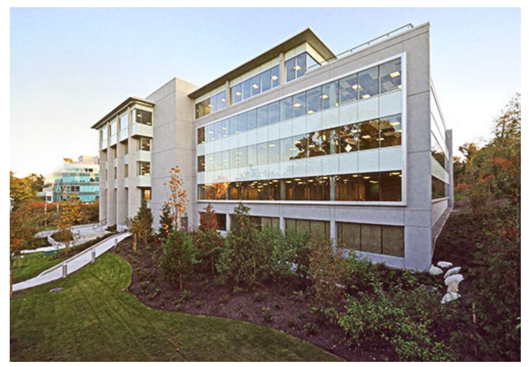
The LDB's new head office in Burnaby, BC is certified LEED Platinum. Pictured here nearing the end of construction in 2009.

During 2019, the LDB's head office relocated to a new head office that is certified LEED Platinum under the Core and Shell rating system of LEED v.2. At the time of construction, the building was one of only four buildings with Platinum level LEED certification in Metro Vancouver. The new head office building uses an air-source variable refrigerant flow system that reduces electricity consumption by about 35 per cent over a conventional HVAC system. The building also features an exterior green wall, extensive outdoor space for staff along with high levels of natural light. Lighting sensors and dimmers are installed throughout the building to conserve electricity. The building's site footprint is small for a building of its capacity, with nearly all parking located underground.