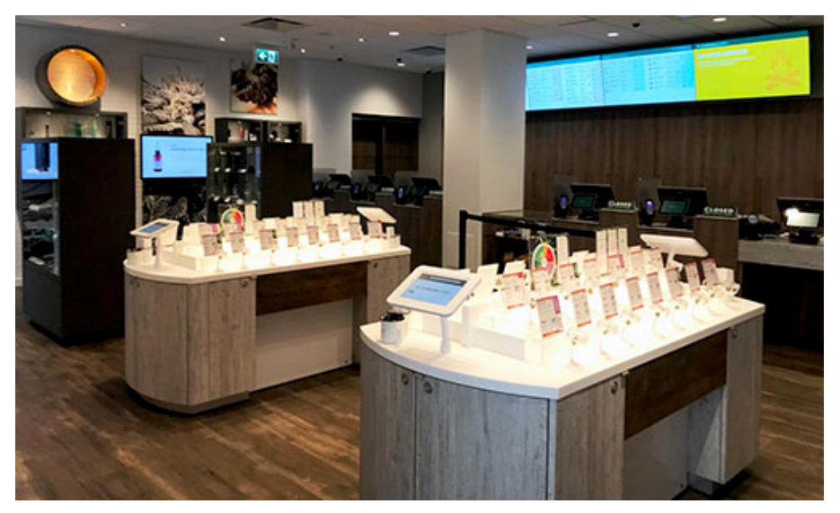
Newly opened BC Cannabis Store interior in 2019

Nine new BC Cannabis Stores opened across the province in 2019 for a total of ten stores across the province. All BC Cannabis Stores feature LED backlit informational panels and high-efficiency lighting throughout. In order to prepare new stores for opening, the LDB Real Estate team uses materials with a low environmental impact such as non-toxic paint, finishes with low chemical emissions, and flooring which does not require waxing and polishing.