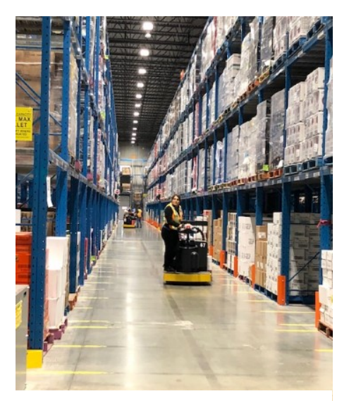
Delta Liquor Distribution Centre was fully operational in 2019

Both the Richmond Distribution Centre and the Delta Distribution Centre have digital screens in staff break areas that display messaging around environmental sustainability and highlight how to participate in LDB environmental initiatives and campaigns.