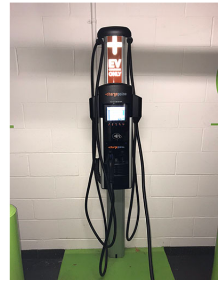
Dual-port EV charging station at LDB's head office.

Another feature of the LDB's new head office is secure bicycle storage and convenient changing and shower facilities. As a result of these improved facilities, the LDB's head office cycling group, "The Spirited Cyclists," grew in 2019 to include more than 40 members.