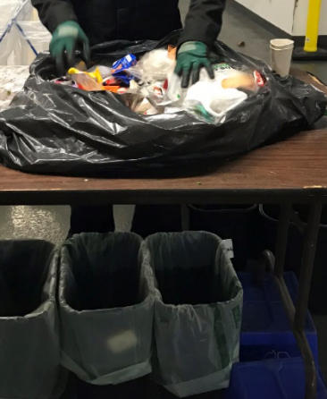
LDB's head office in 2019