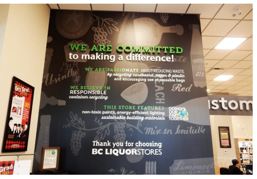
Green wall feature at a BCLS

Open-front coolers at BCLS are equipped with a shade that is drawn at closing time every evening to reduce excessive cooling.