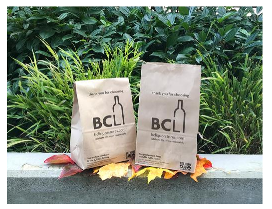
BC Liquor Store paper bags

BC Cannabis Stores continue to only offer paper bags to customers, as they have done since becoming operational in 2018. They currently charge 10 cents per paper bag and will be moving to 25 cents per bag on June 1, 2021. At all stores, employees ask customers if they would like a bag instead of automatically providing one to encourage customers to bring their own bags.